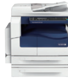
One Tray Module