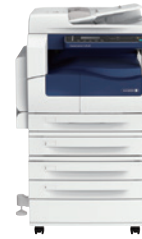
One Tray Module Two Tray Module

Note: Use Fuji Xerox toner cartridges to ensure optimal performance.